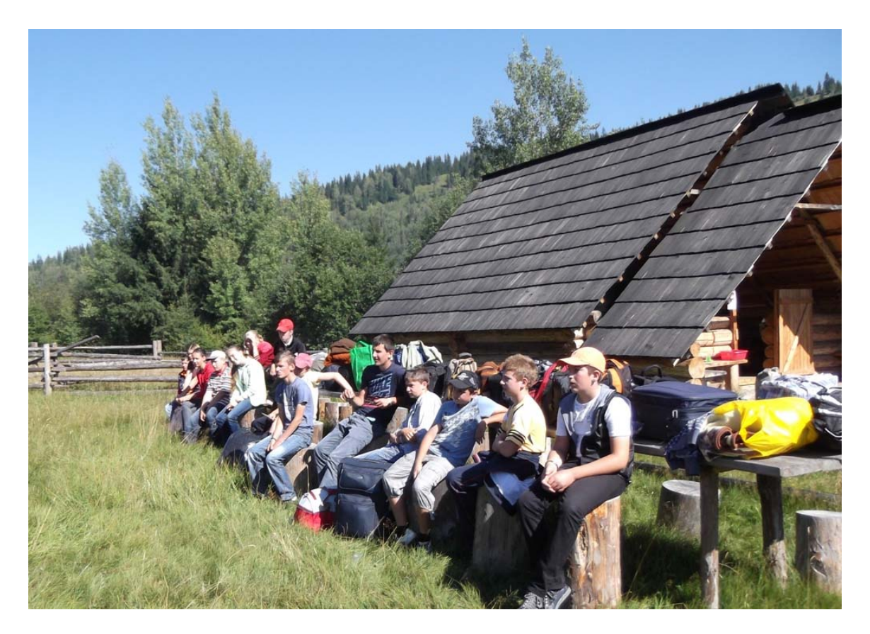
Children on arrival at the RCHF Botos campsite August 2012