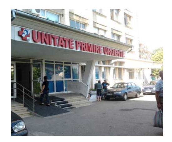
Iasi Children's university Hospital SF Maria

The RCHF vehicle is vital to our work as an NGO and performs many tasks. Recently we transported 2 young Children to Hospital in Iasi from their home town of Dorohoi. The trip of over 200 kilometres' allowed both children to be seen and examined by a leading heart specialist. Unfortunately in Romania the ambulance service fails to cover such needs despite the fact these children suffer with serious heart problems.